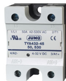
TYA 432-45/50 (25), 530 (265)

The input status is indicated by an LED.